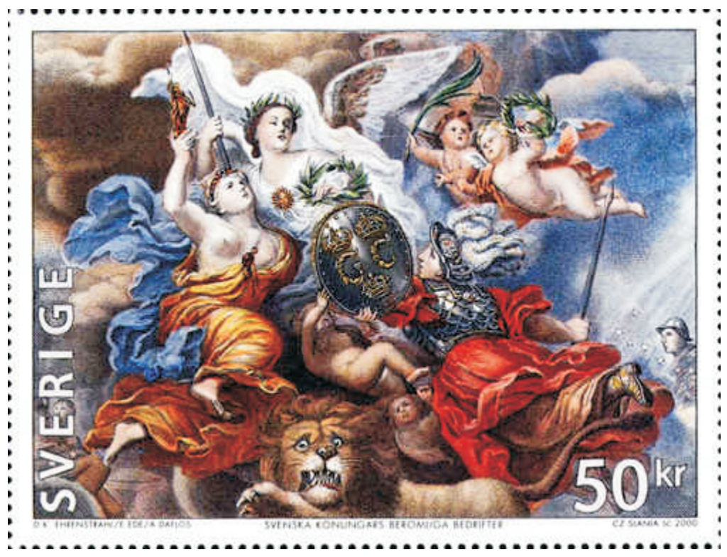
"Great Deeds by Swedish Kings" — Czesław Slania's 1000<sup>th</sup> stamp at original size. [This low resolution reproduction doesn't do the original justice but is the best I could find. Ed.]